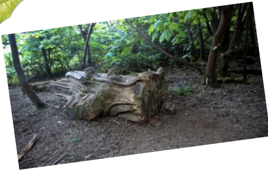
Big log jump